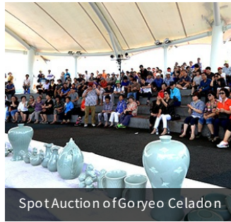
Spot Auction of Goryeo Celadon