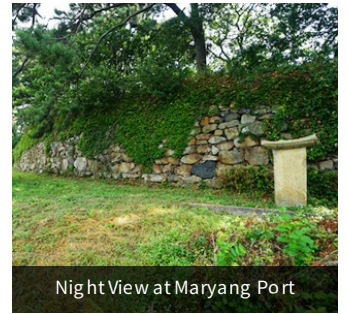
Night View at Maryang Port