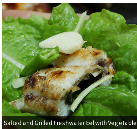
Salted and Grilled Freshwater Eel with Vegetable