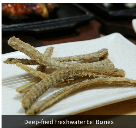
Deep-fried Freshwater Eel Bones