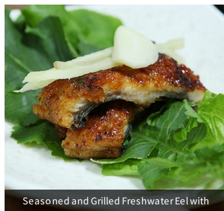
Seasoned and Grilled Freshwater Eel with